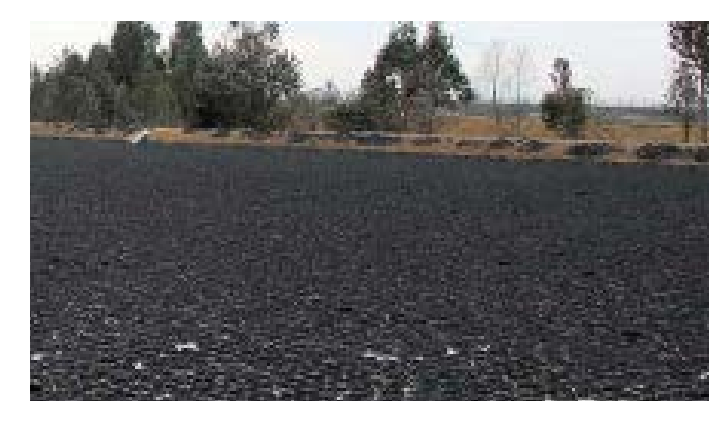
A total of 115.000 m<sup>2</sup> slurry lagoons for market leading processing company